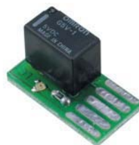
MLR (Item code 161101)

Additional relay module for expanding RXP modular receiver up to 4 channels