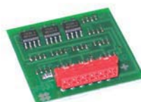
MEM1000 (Item code 161201)