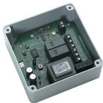
RXP2S220 (Item code 11D002)