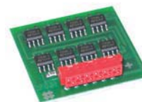
MEM1000-I (Item code 161202)

Also available in MEM1000-I version where it is possible to associate each code inserted with a 10 character description that can be read using the PROG2 portable programming module